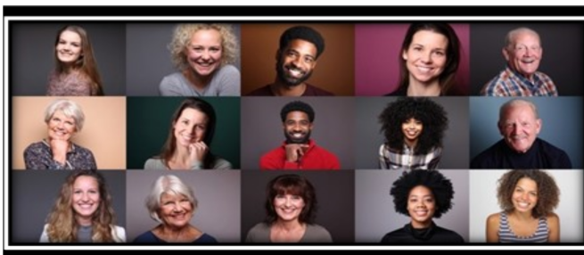
The pleasantness of a friend springs from their heartfelt advice.

I remember as an adolescent, how I had developed relationships with a couple of young men, and we would go out to private parties almost every weekend. Typically, we would pick up