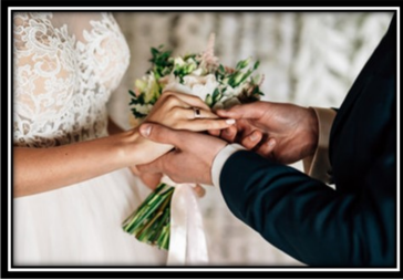
Marriage—A lifelong covenant to do good

We concluded that marriage is much more than sizzling hot romance; it is about a companionship through the twists and turns of life.