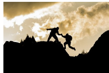
“Neighbor, there is help.”

Lack of Control: This may be the lack of self-control, as one tends to do inappropriate things (e.g. sexual indiscretions), or it may be the lack of leverage, as one is forced into certain rituals, that further foster the damage.