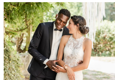
Lay a strong foundation and don't stop. Love Strong.

A covenantal relationship calls for following the visionary—this is how it works. Failing to follow breaks the covenant, and hurts the relationship.